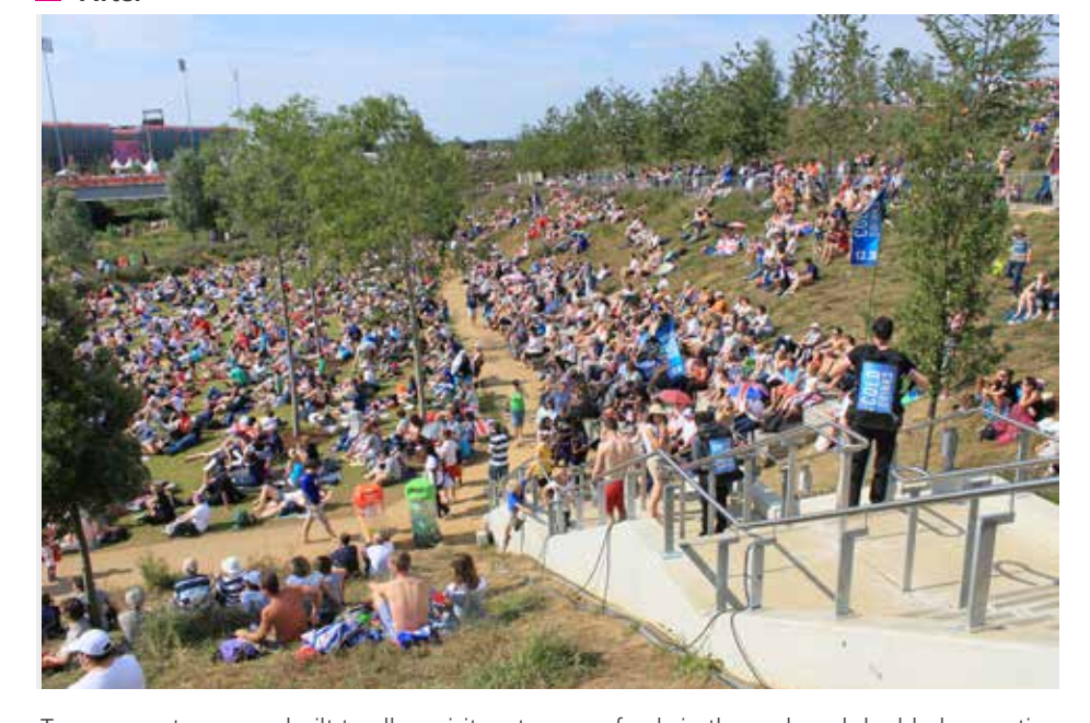
Temporary steps were built to allow visitors to move freely in the park and doubled as seating.