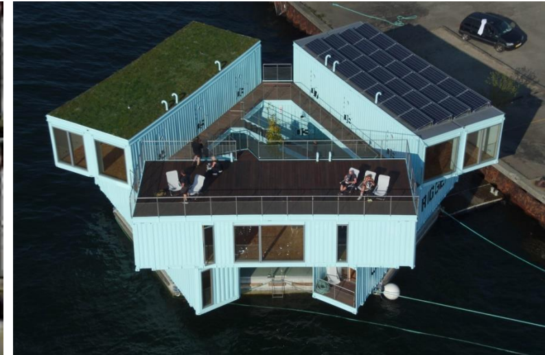
Urban Rigger (Copenhagen)