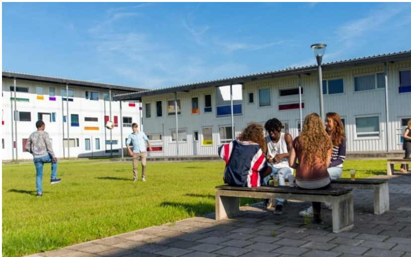
Startblok Riekerhaven (Amsterdam)