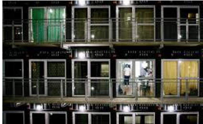
Urban Cribs (Gothenberg)