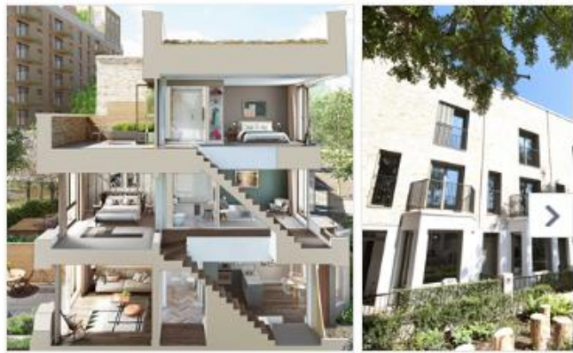
A rare opportunity in Zone 1